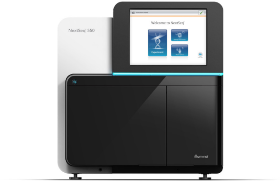
Figure 1: NextSeq 550 System—Proven platform combining the power of NGS and array technologies to support accurate genomic studies across a broad range of applications.

The NextSeq 550 System combines tried-and-true next-generation sequencing (NGS) and array capabilities with tunable outputs, enabling both small and large labs to scale to meet their needs. As a foundational instrument in the Illumina NGS system portfolio, the NextSeq 550 System is ideal for labs that want to expand beyond their current capacity and new labs interested in harnessing the complementary powers of sequencing and genotyping on a single instrument (Figure 1). Its fast DNA-to-results workflow enables rapid sequencing of exomes, targeted panels, and transcriptomes in a single run, with the flexibility to switch to low- or high-throughput sequencing as needed. Illumina scientists are available at every point along the way with support and guidance, enabling large clinical research labs to scale with confidence and smaller labs to employ both genotyping and sequencing technologies.